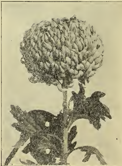
MRS. C. C. POLLWORTH

2 1/4-inch pots: Per dozen, $2.00; 25 plants, $4.00; 100 plants, $15.00.